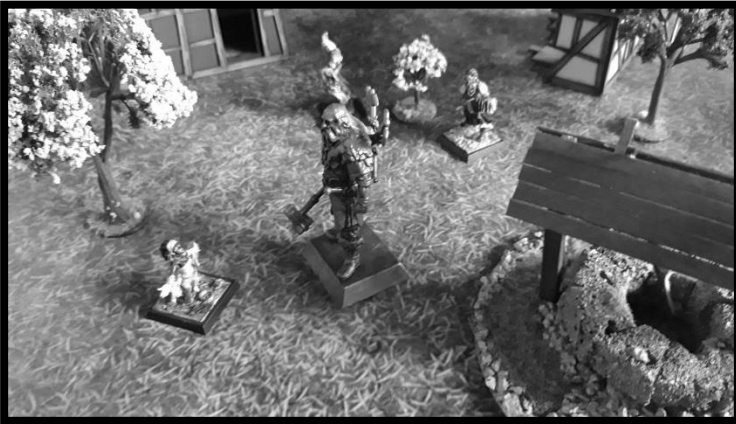
The Wishing Well next to the statue of Count von Tannenfels

Designate an area of 5" around a corner as the sick bay. This is, where your mercenaries start.